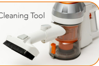
2-in-1 Cleaning Tool